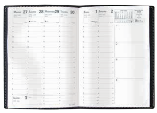
University - 4" × 6" (10 × 15 cm)

Both the Academic Minister and the University include annual planning pages, daily 8am to 9pm schedules, priority boxes, and space for contacts, but the Academic Minister also features monthly planning pages, three monthly calendars on each spread instead of one, and 90g paper instead of 64g.