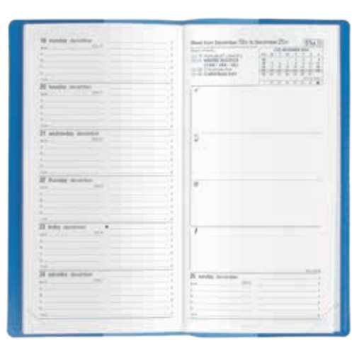
IBT RAVELER - 3 ½" × 6 ¾" (8.8 × 17 см)